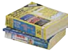
Phone Books All types & sizes