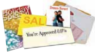
Office Paper & Junk Mail Envelopes, Flyers, Brochures, Postcards, etc.