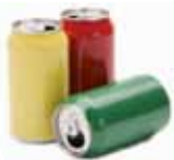
Aluminum Cans Empty cans only