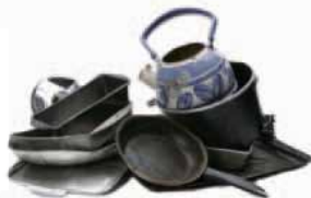
Kitchen Cookware Metal pots, pans, tins & utensils