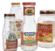
Empty & Clear Bottles & Jars Only