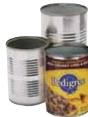
Steel & Tin Cans Empty cans only