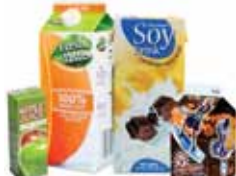
Food & Beverage Containers Empty containers only