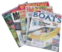
Magazines & Catalogs All types & sizes