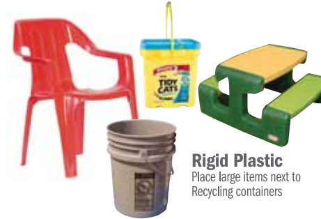
Rigid Plastic Place large items next to Recycling containers