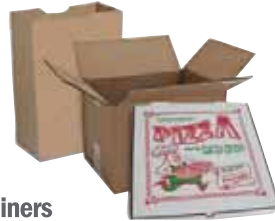
Cardboard, Pizza Boxes & Paper Bags Flatten cardboard and if needed put next to your tote at no more than 4' pieces . Remove wax paper from pizza boxes