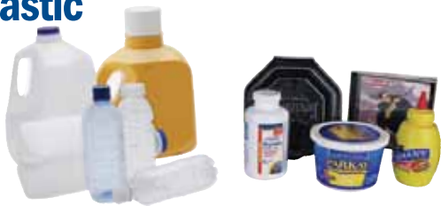
Plastic Jugs/Bottles/Household Plastic Empty containers only