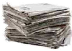
Newspaper Remove bags, strings & rubber bands