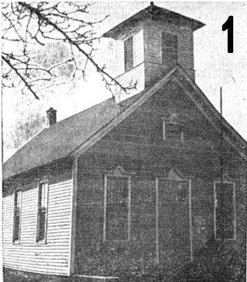
BEING DISCARDED — Pendleton town officials are not certain yet what will happen to the present Town Hall when the new structure is ready for use. This building, which has the appearance of a country church, has served as the Pendleton Town Hall since 1898.

625-8833, ext. 109 or 123; schase@pendletonny.us