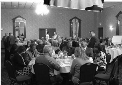
Lions 50th Anniversary Celebration, A wonderful evening celebrating many great years of service to our Community!